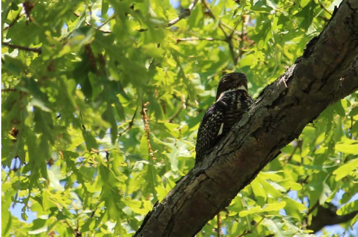
Common Nighthawk